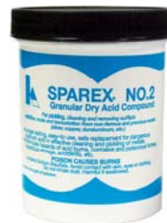
Pickling agent for removing firescale from fired copper.