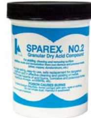
Pickling agent for removing firescale from fired copper. ACW #F-039

Note: Thoroughly clean your tumbler and tumbling media before and after polishing the copper, or use a separate set of brushing/burnishing tools so as not to contaminate any subsequent artwork of any other metal.