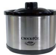
Convenient mini-crock pot for heating pickling solution ACW #F-222.