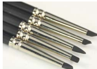
Rubber-tipped sculpting tools ACW #F-251