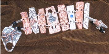
Art Clay Copper and Silver Mixed Media Bracelet by Arlene Mornick

Early testing has shown amazing and lovely results when firing Art Clay™ Copper using a butane torch, and the clay has also fired beautifully using the Speedfire Cone System. These additional firing options open doors in working with Art Clay™ Copper that other non-precious metal clays do not offer. The shorter firing time now allows for a copper clay to be used or taught as a single-day class or workshop. As more artists begin working and experimenting with Art Clay™ Copper, we will also find additional properties that allow for use with various stones, mixed media, or cross-industry techniques.