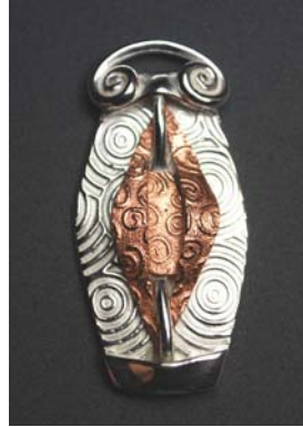
Art Clay Copper and Silver Pendant by Carol Babineau