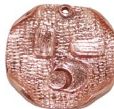
Disc Pendant by Carol Babineau—Torch fired!

NOTE: If a hot, fired piece is left to cool in the kiln or open air after firing, the oxidized layer will be thicker and small bits may fly into the air. If you have fired a piece and will not be quenching it, cover it immediately after firing with fiber blanket until cool.